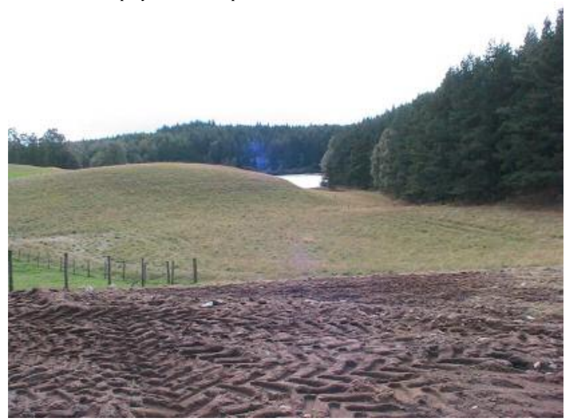
Fig. 2 – Looking South West towards Lochan Geal from access road

1 This application is submitted in outline format, and proposes the erection of a dwellinghouse at a site which is located in a countryside area on land adjacent to a lochan ("Lochan Geal"), at Dalnavert, Feshiebridge (see Fig. 1 above). The site is positioned at the end of an unsurfaced forest track which leads westwards, through some cottages and a forested area, from the Kingussie/Inverdruie stretch of the B970. The area of ground delineated on the submitted drawings, comprises open grazing land bordering the shore of the lochan which is located to the south west side (see Fig. 2 below). The lochan and the site are enclosed on the north and west sides by coniferous woodland, and to the east and south sides the open grazing land rises up from the shoreline of the lochan. There is also a group of trees located within the boundaries of the site but on the shoreline. The access track, owned by Forest Enterprise, provides access to the Dalnavert Community Co-operative (a residential agricultural settlement) to its north- east, two residential properties to its south-west (Druim-Na-Coille, currently being extended, and Drumcluan) and an open area of ground to its north which formerly was used as a caravan site. Opposite the site, on the south-west side of the lochan, there is a tall birch tree, set against the background of the forest, which accommodates an abandoned osprey nest in its top branches.