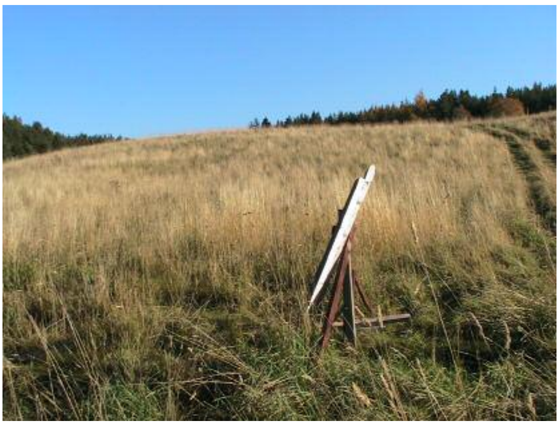
Fig. 3 - Hillock looking North East from shoreline

building into the west bank of an existing hillock and sculpt the land around it (see Fig. 3 below). The application forms state that the house would be finished in dressed logs and coloured profiled metal sheeting. A new access track of approximately 200m in length, from the end of the existing track, will be formed through the grazing land but following the tree line on the north side. Some new tree planting is also proposed within the site. A new septic tank with soakaway is proposed for drainage. The applicant has submitted that the proposal would contribute approximately £120,000 per annum to the local economy. It is also stated that the area of open grazing land between the actual house site not required for the proposed development, would be offered for lease, at a peppercorn rent for cattle grazing, or be planted with approximately 3-4 acres of native tree species.